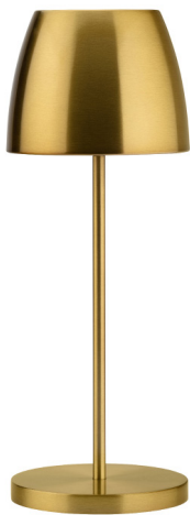
Item No. 769103 LED CORDLESS LAMP BRUSHED GOLD