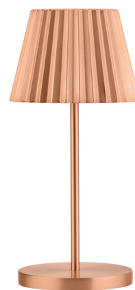
Item No. 769234 LED CORDLESS LAMP BRUSHED COPPER