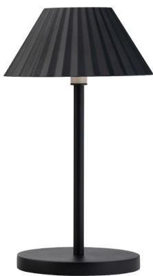
Item No. 769201 LED CORDLESS LAMP BLACK