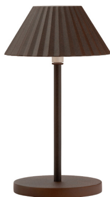
Item No. 769202 LED CORDLESS LAMP COCOA