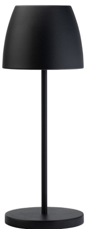
Item No. 769101 LED CORDLESS LAMP BLACK