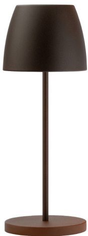
Item No. 769102 LED CORDLESS LAMP COCOA