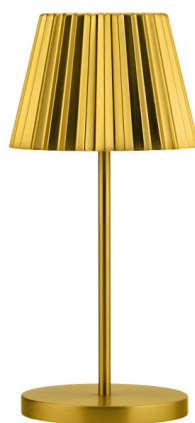
Item No. 769233 LED CORDLESS LAMP BRUSHED GOLD