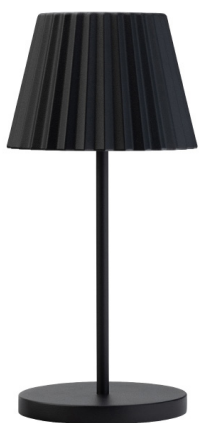
Item No. 769231 LED CORDLESS LAMP BLACK