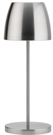
Item No. 769105 LED CORDLESS LAMP BRUSHED SILVER