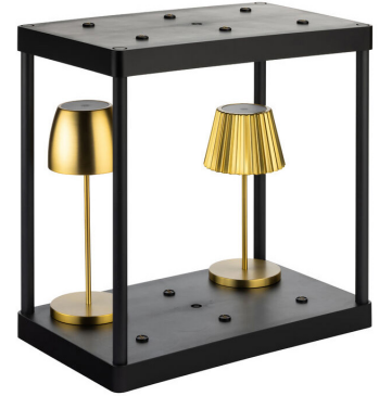
Item No. 769000 CHARGING STATION BLACK