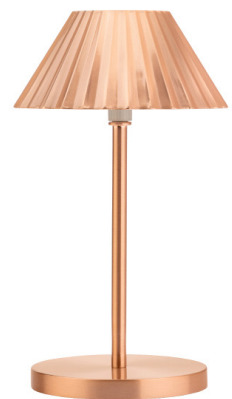
Item No. 769204 LED CORDLESS LAMP BRUSHED COPPER