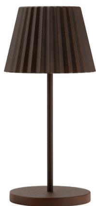
Item No. 769232 LED CORDLESS LAMP COCOA