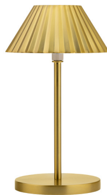
Item No. 769203 LED CORDLESS LAMP BRUSHED GOLD